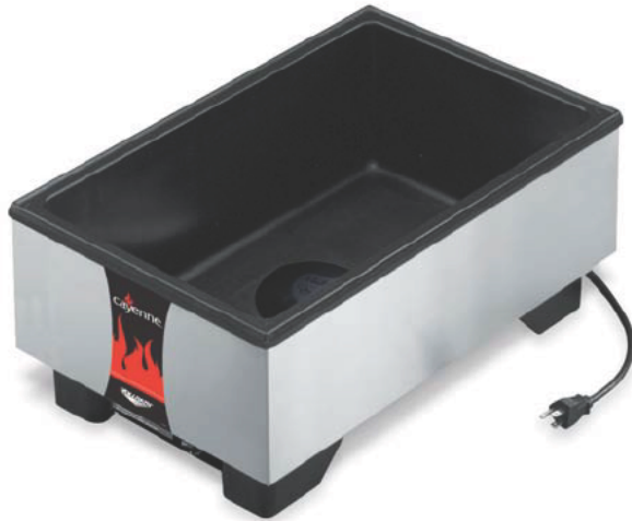
Cayenne® Model 1001 Warmer