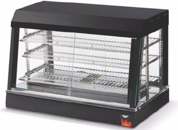
Cayenne® Hot Food Merchandiser