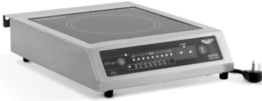
Induction Range: Intrigue™ Commercial Countertop

MODELS: 69500 1.8 kW @ 120V (U.S. Only) 69510 1.4 kW @ 120V (Canada Only)