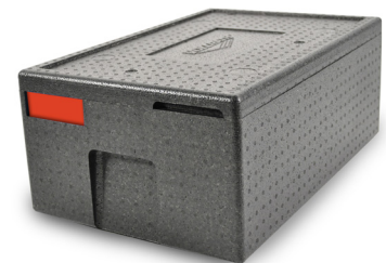
Shown with optional color tag