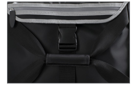
Heavy-duty locking clip