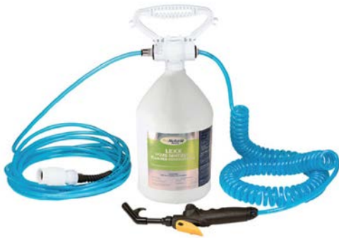
Portable Wandstation and LEXX Concentrated Sanitizer & Cleaner