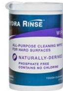
Hydra Rinse Single-Use Wipes