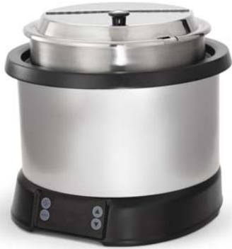
Mirage® Induction Rethermalizer