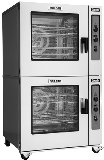
Model ABC7E (shown stacked)