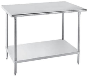
MSLAG-X Series Flat Top

LEGS: 1 5/8" diameter tubular Stainless steel. Stainless steel gussets. 1" adjustable stainless steel bullet feet.