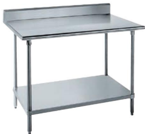
KMSLAG-X Series 5" Backsplash