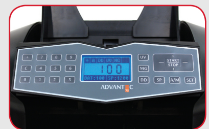
Easy to read display