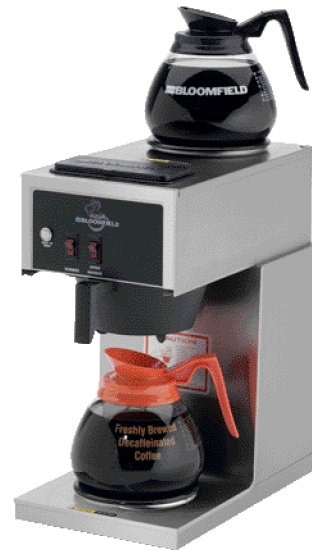
8543-D2 with optional decanters

If you're looking for rich, flavorful coffee but are tight on counter space, plug in the Bloomfield Lo-Profile® Pour-Over brewing system. At a little under 17" tall, it's short in stature, but long on features. Like all Bloomfield products, this proven, efficient brewing system is designed to take advantage of the finest electrical components and has the lowest service cost in the industry for this type of brewer. Our exclusive water delivery system spreads a precise amount of water over the coffee grounds for complete saturation and much better taste.