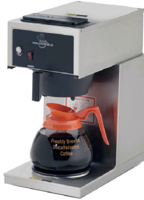
8542-D1 with optional decanters

8543-D2 Koffee King® Two Warmer In-Line Pour-Over, Lo-Profile® Coffee Brewer