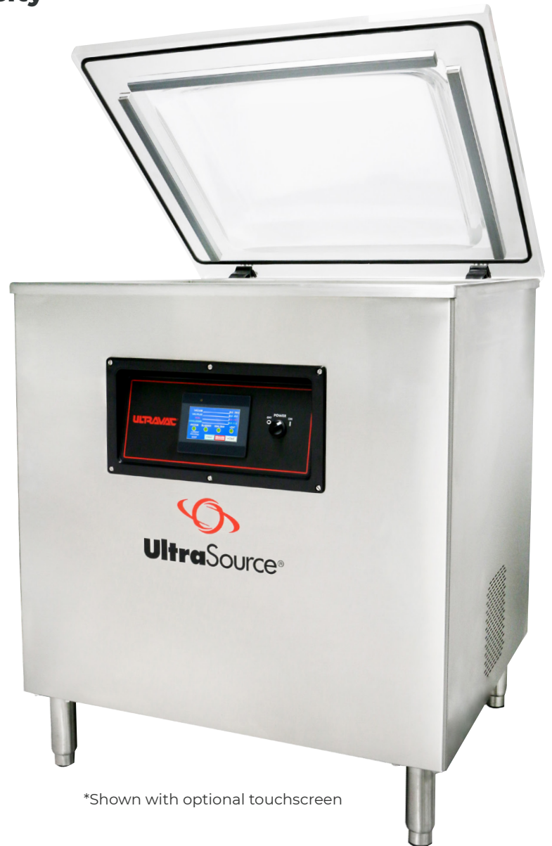
*Shown with optional touchscreen

The heavy duty and rugged, 2-hp Busch® vacuum pump powers the Ultravac 600 for years of dependable service