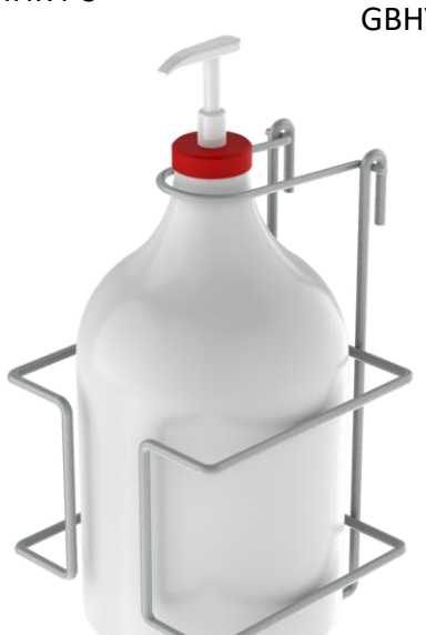
1 Gallon SHK4-1G