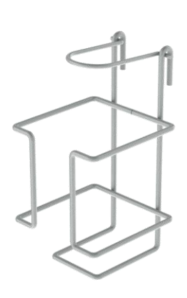
2 Liter SHK4-2L

All in Metroseal Gray with Microban *GBHVK3 is in Metroseal Green with Microban