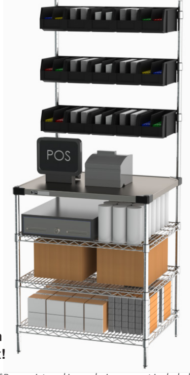
Ships in One Box!