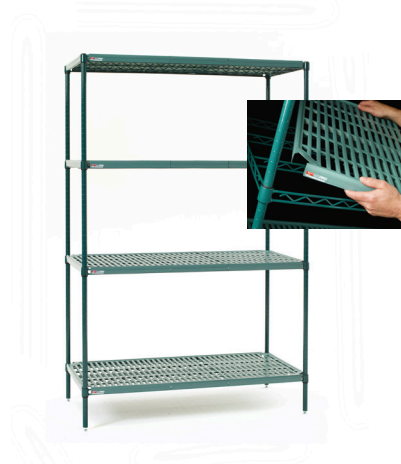
Four Shelf Starter Model