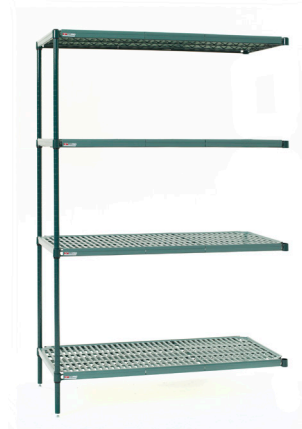
Four Shelf Add-on Unit (includes "S" hook brackets)