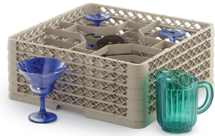
TR13K K K K K K K K 5-COMPARTMENT 7½" (19.5 cm) sq. compartment 8" (20.32 cm) diagonal