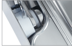
Breakthrough Hinge Design