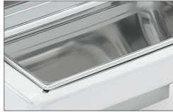
Dripless Water Pan