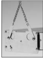
Standard mounting tabs. See back page for other mounting options.