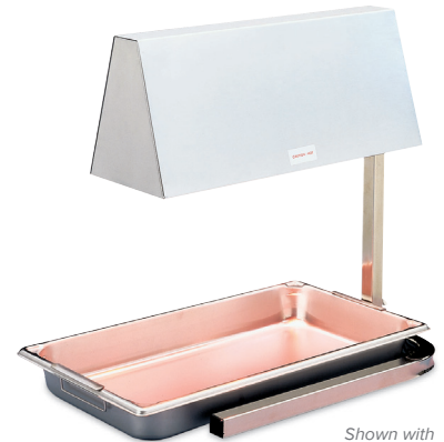
Shown with optional full-size pan sold separately