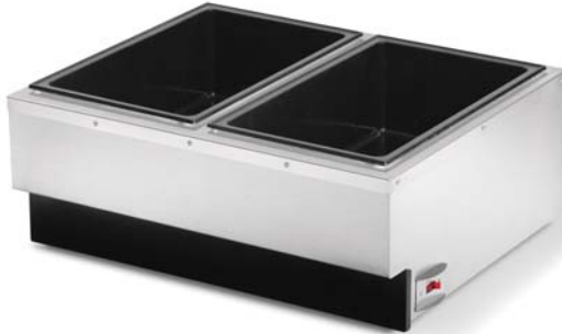
Cayenne® Dual Warmer