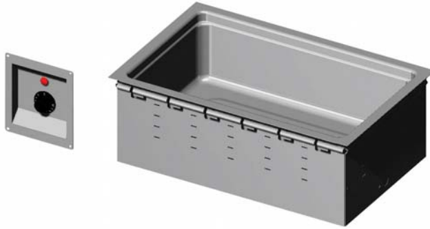
Bottom-Mount Vollrath Well