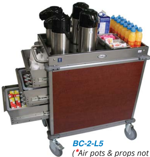
BC-2-L5 (*Air pots & props not included)