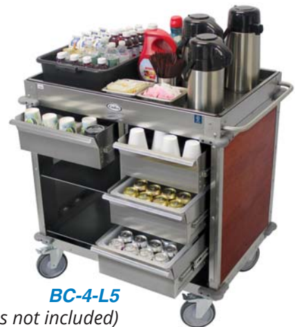
BC-4-L5 (*Air pots & props not included)

BC-2-L Series: Handle Side view: 3 drawers & bottom shelf