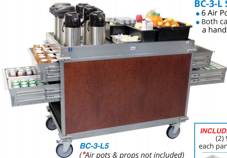
BC-3-L5 (*Air pots & props not included)