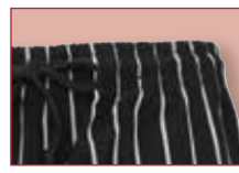
Elastic drawstring waist