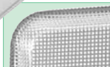
Full edge-to-edge perforation