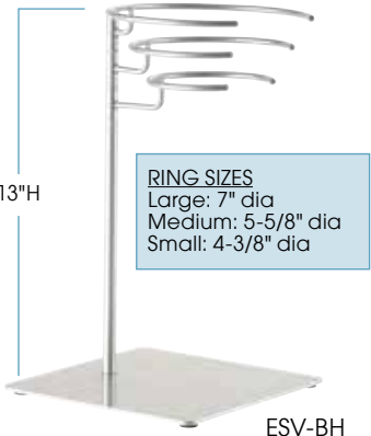
RING SIZES Large: 7" dia Medium: 5-5/8" dia Small: 4-3/8" dia