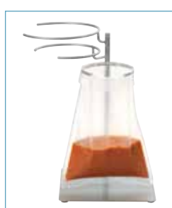
Bag stand conveniently holds various sizes of vacuum bags open for easy filling