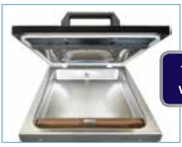
11-1/2" seal bar with bag clamp