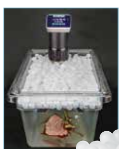
ESVI-1 with ESV-IB insulation balls, to reduce evaporation and hold heat in