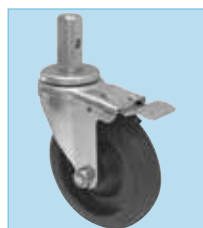
ALRC-5STK 5" caster with brake