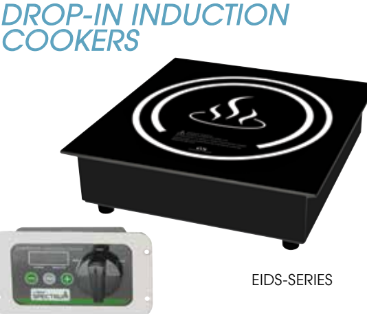
Control panel mounts to front of counter where drop-in cooker is installed