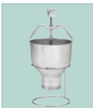
APCD-6 &amp; APCD-6R