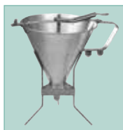
SF-7 &amp; SF-7R