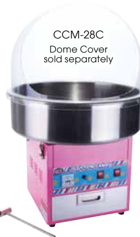
CCM-28C Dome Cover sold separately