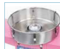
CCM28-P10 Shown in CCM-28M