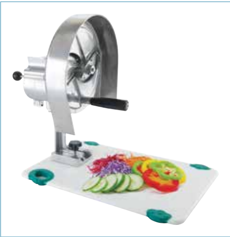
FVS-1 mounted and ready