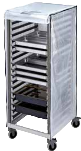
GBCTUGNPR21 Optional Heavy Duty Vinyl Cover for GN 2/1 Full Size Trolley.