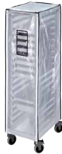
GBCTUGNPR11 Optional Heavy Duty Vinyl Cover for GN 1/1 Full Size Trolley.

All Trolleys ship knockdown (KD) complete in 1 box with casters and bottom frame wedges factory assembled on posts.