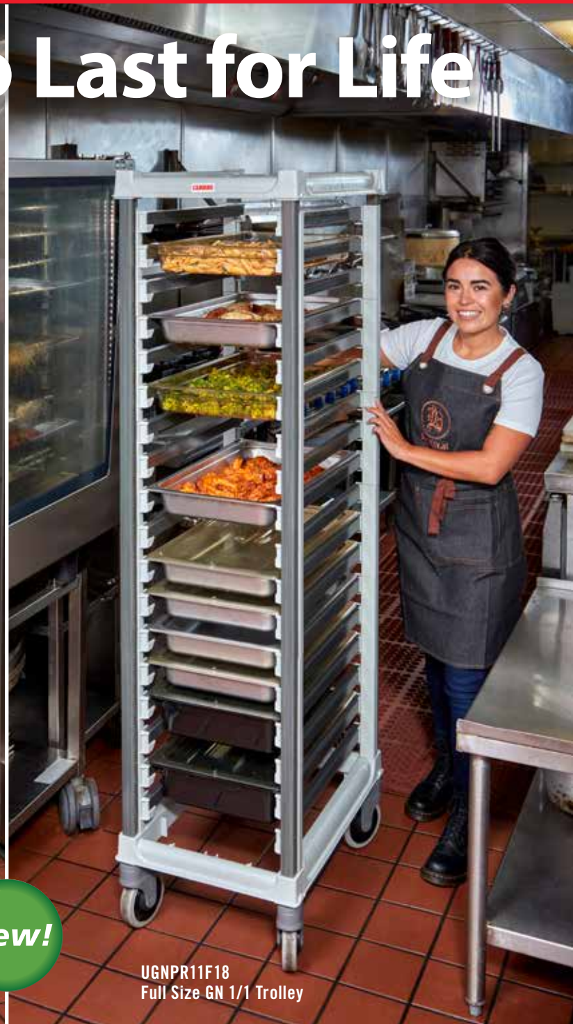
UGNPR11F18 Full Size GN 1/1 Trolley