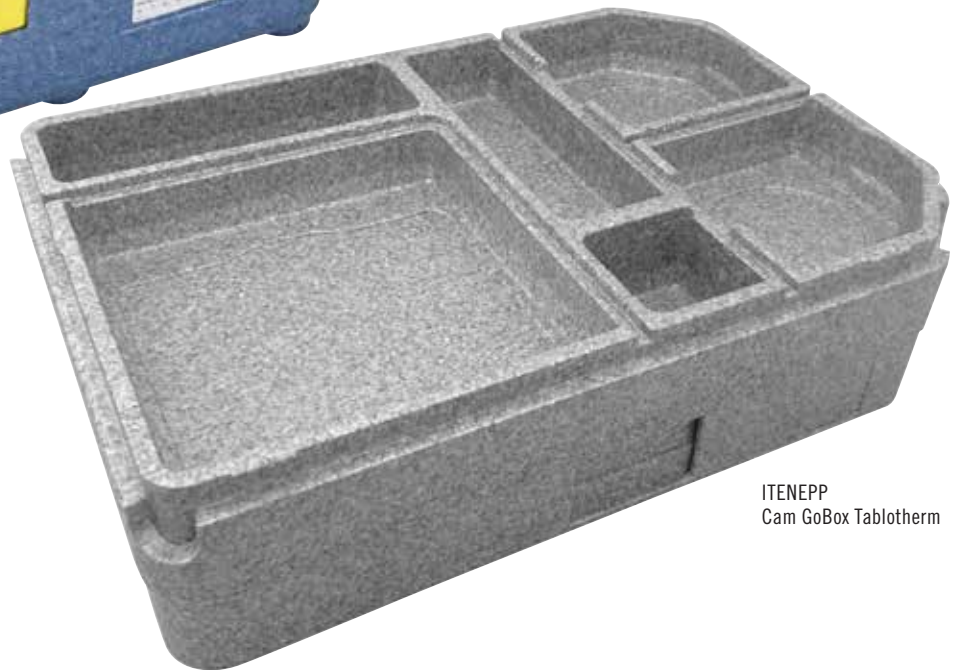
ITENEPP Cam GoBox Tablotherm