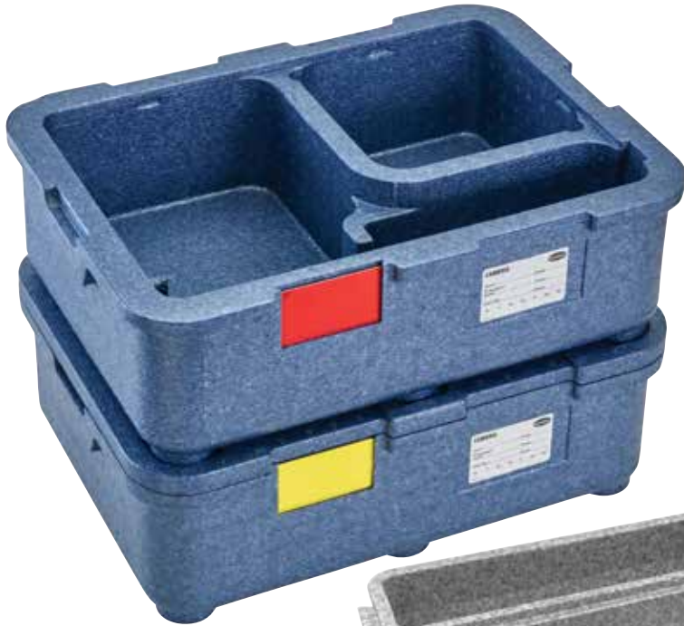
EPPMD4835 Cam GoBox Lunchbox