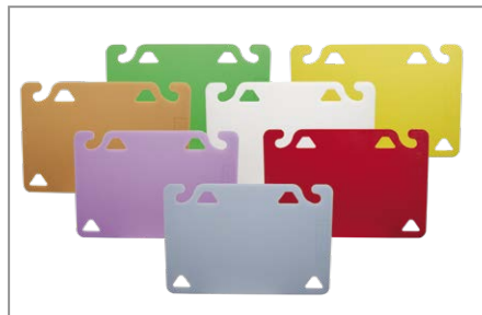
Color-Coded Cutting Board Refills to reduce cross-contamination