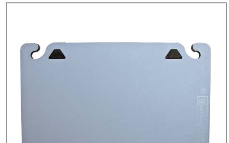
Double Food Safety Hooks for sanitary transport and storage