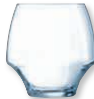
U1033 Old Fashioned (13 ½ Oz.) H: 3 ¾" T: 2 ¾" B: 1 ⅞" M: 3 ⅝" 2 Dz.