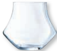
U1032 Warm Tumbler (10 Oz.) H: 3 ⅝" T: 2 ⅜" B: 1 ⅞" M: 3 ⅞" 2 Dz.