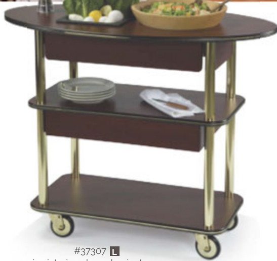
#37307 L in victorian cherry laminate