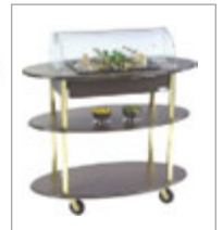
#36306 L in red maple laminate