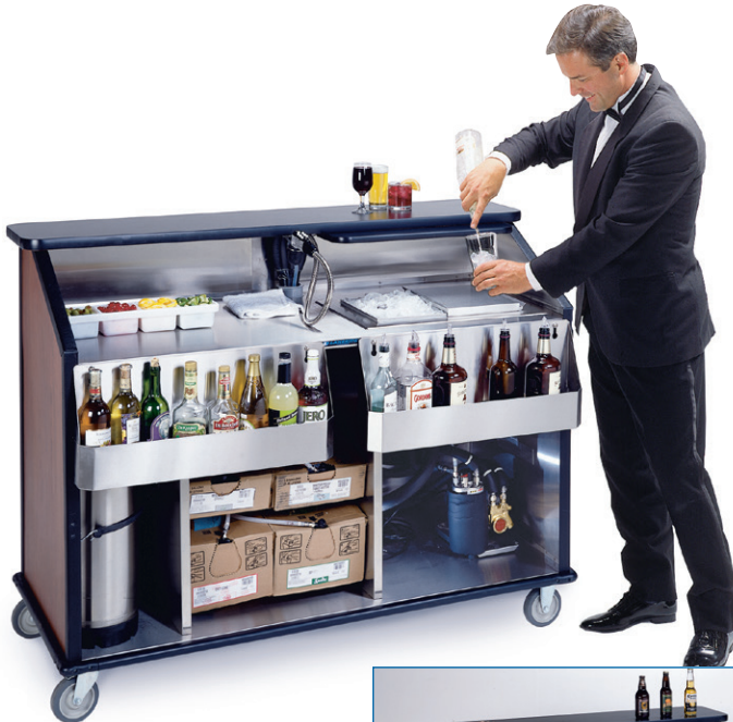
Model 889 shown with optional Post-Mix dispensing system and optional Bag-in Box rack kit.