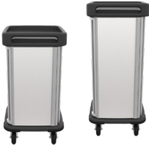
Products on the picture are shown with the optional corner bumpers.