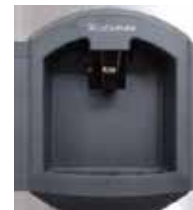
Easy Push Chute