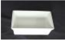
1ASBW247NSF The Domino Coated Aluminum Rectangle Bowl.