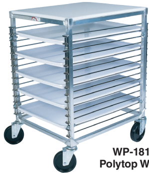
WP-1815D/PPT Polytop Workstation