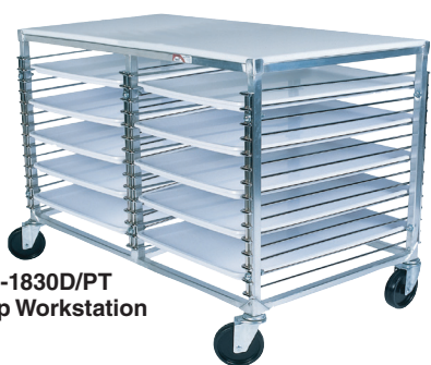
WP-1830D/PT Polytop Workstation