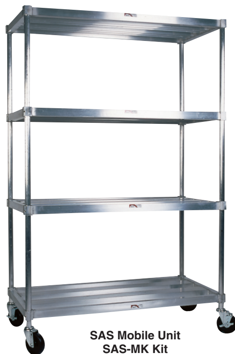
SAS Mobile Unit SAS-MK Kit