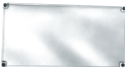
Reinforced Solid Shelving SASSR Series Top View