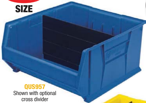
QUS957 Shown with optional cross divider