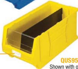
QUS953 Shown with optional divider, window front, adhesive label holder and insert

AL-23 2" x 3-1/2" Adhesive clear label holder and inserts. Package of 24 (Sold separately)