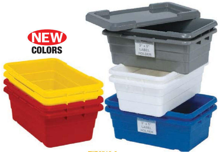
TUB2516-8 Nesting and Cross Stack