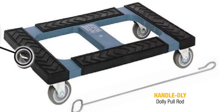
HANDLE-DLY Dolly Pull Rod