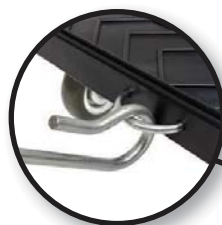
ATTACHED PULL RING allows dolly to be pulled with ease