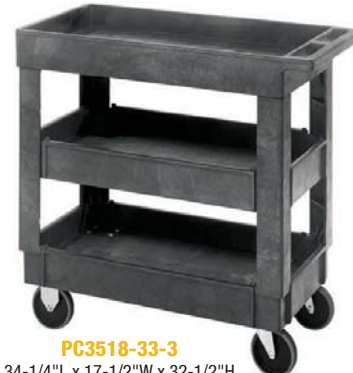
PC3518-33-3 34-1/4"L x 17-1/2"W x 32-1/2"H