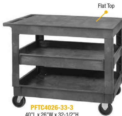
PFTC4026-33-3 40"L x 26"W x 32-1/2"H