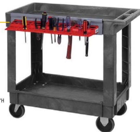
PC3518-33 + PCTH 34-1/4"L x 17-1/2"W x 32-1/2"H Shown with optional Tool Holder (Tools not included)

Shown with optional Tool Holder Attachment