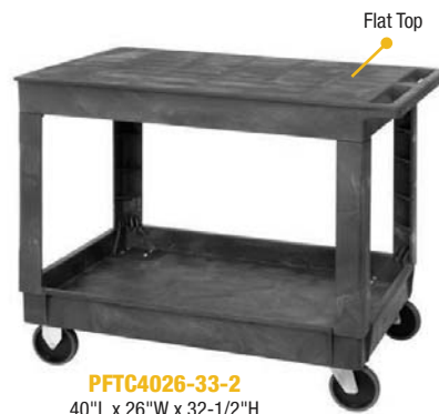
PFTC4026-33-2 40"L x 26"W x 32-1/2"H