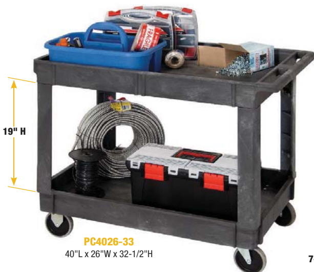
PC4026-33 40"L x 26"W x 32-1/2"H