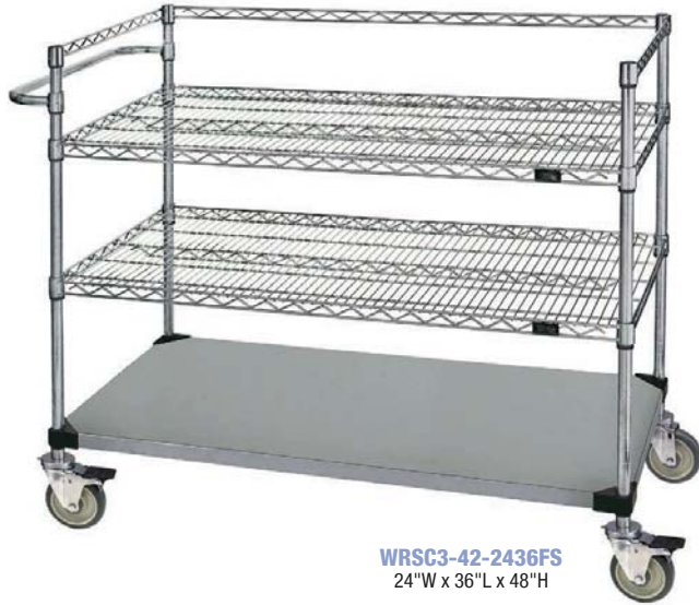
WRSC3-42-2436FS 24"W x 36"L x 48"H