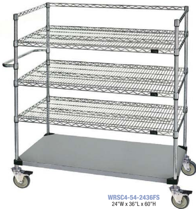
WRSC4-54-2436FS 24"W x 36"L x 60"H