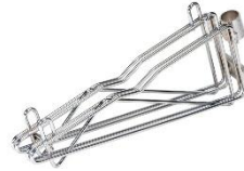
DCB Post Cantilever Double Arm