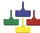
PS-LH3 Hanging Label Tag. Fits 1-3/8" x 3" adhesive label. Available in 5 colors (pack of 25)