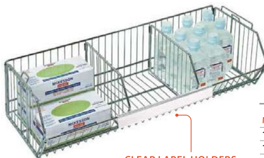
1436BC Shown with Dividers and Clear Label Holder (Sold separately)

Offer a variety of storage, display and mobile supply applications. Dividers can be used to separate product. Accessible front and a wide selection of sizes allow for all types of product to be used from storage to display. (Dividers sold separately) Finish: Chrome