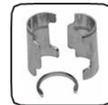
Aluminum Split Sleeve