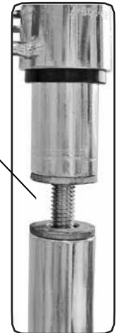
Fully Threaded Stud Connector