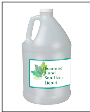
FOAMING SANITIZER # SANILQUID