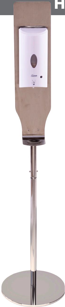
FLOOR STANDING UNIT # SANIDIS-FM