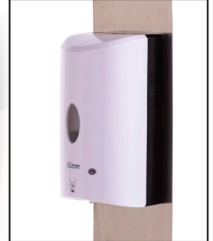
INFRARED SENSOR FOR TOUCHLESS APPLICATION