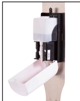
FLIP DOWN FRONT GIVES EASY ACCESS TO CONTROLS