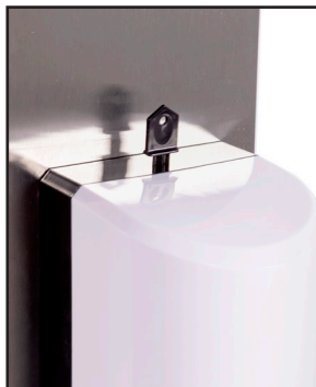
INCLUDES SECURITY KEY