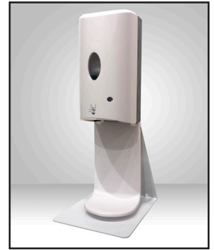
COUNTER TOP UNIT # SANICTWTE