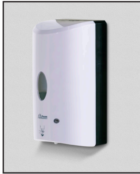
WALL MOUNT UNIT # SANIWM-FM