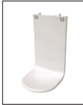
PLASTIC CATCH TRAY FOR WALL MOUNT UNIT # SANITRAY