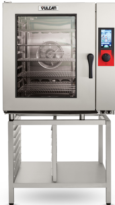
Model TCM101E Shown on optional stand