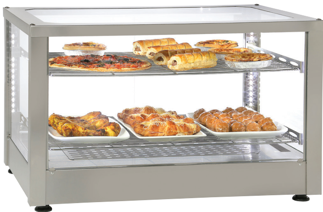
Shown with stainless steel exterior