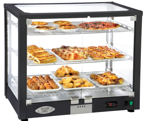
Shown with black exterior