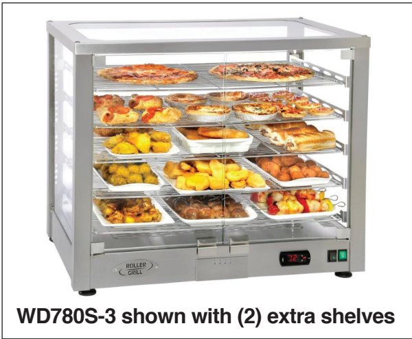
WD780S-3 shown with (2) extra shelves